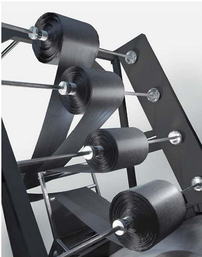
↑ SIGRACET GDL optimized gas diffusion layers

Optimized gas diffusion layers for PEM and DMFC fuel cell applications